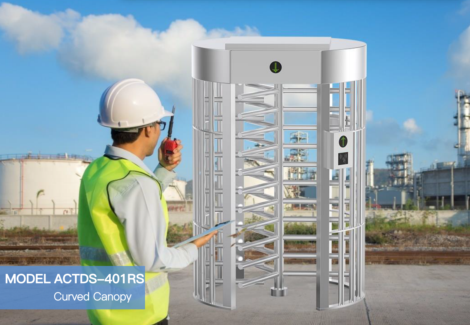
MODEL ACTDS-401RS Curved Canopy